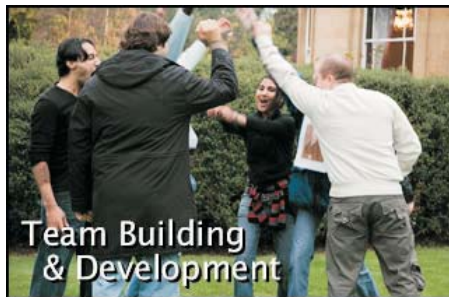
Team Building & Development